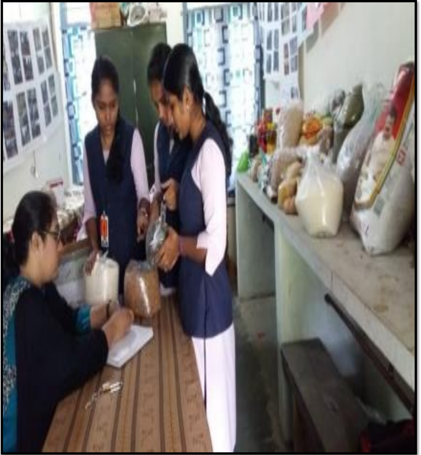
Flood Relief services offered by Mar Thoma College For Women,Perumbavoor