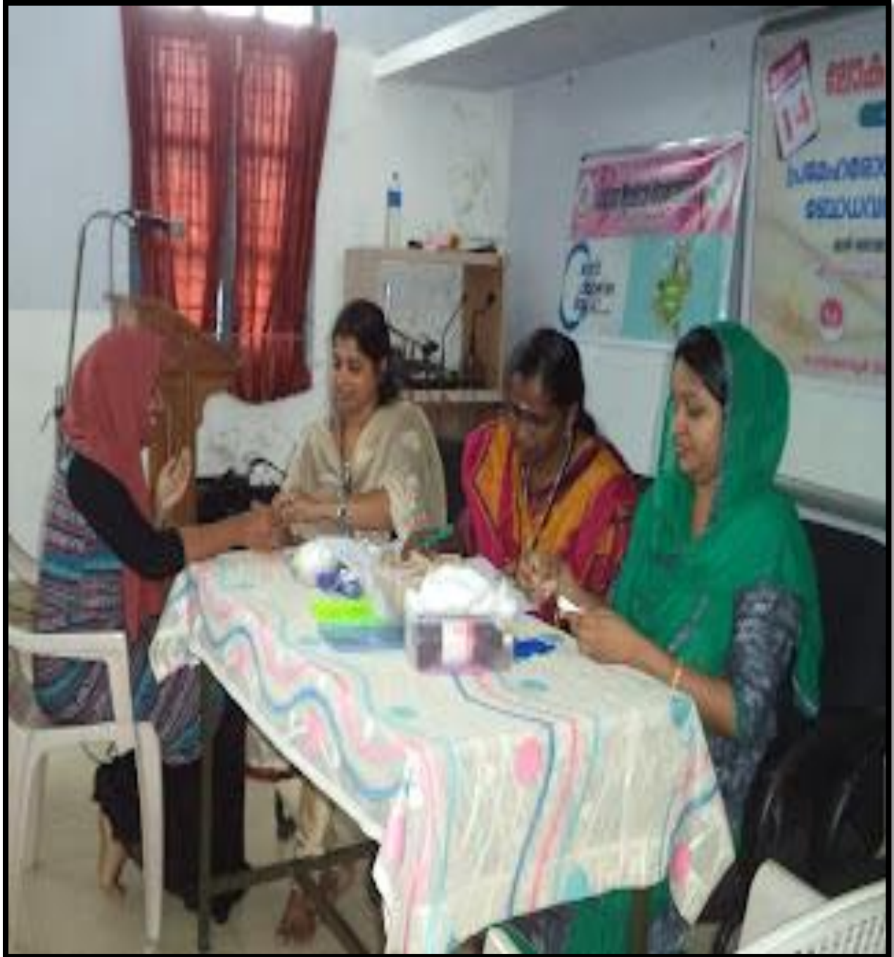
NSS unit and the Department of Zoology of Mar Thoma College for Women, Perumbavoor in association with Government Taluk Hospital, Perumbavoor conducting Blood Screening