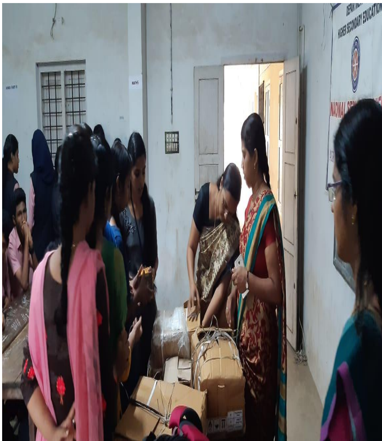
The Student Solar Ambassador Programme at Govt Higher Secondary School, Perumbavoor was organised by the Physics Department of Mar Thoma College, Perumbavoor in collaboration with IIT Mumbai and Energy Conservation Society as part of Gandhi Global Yatra on 29/10/2019