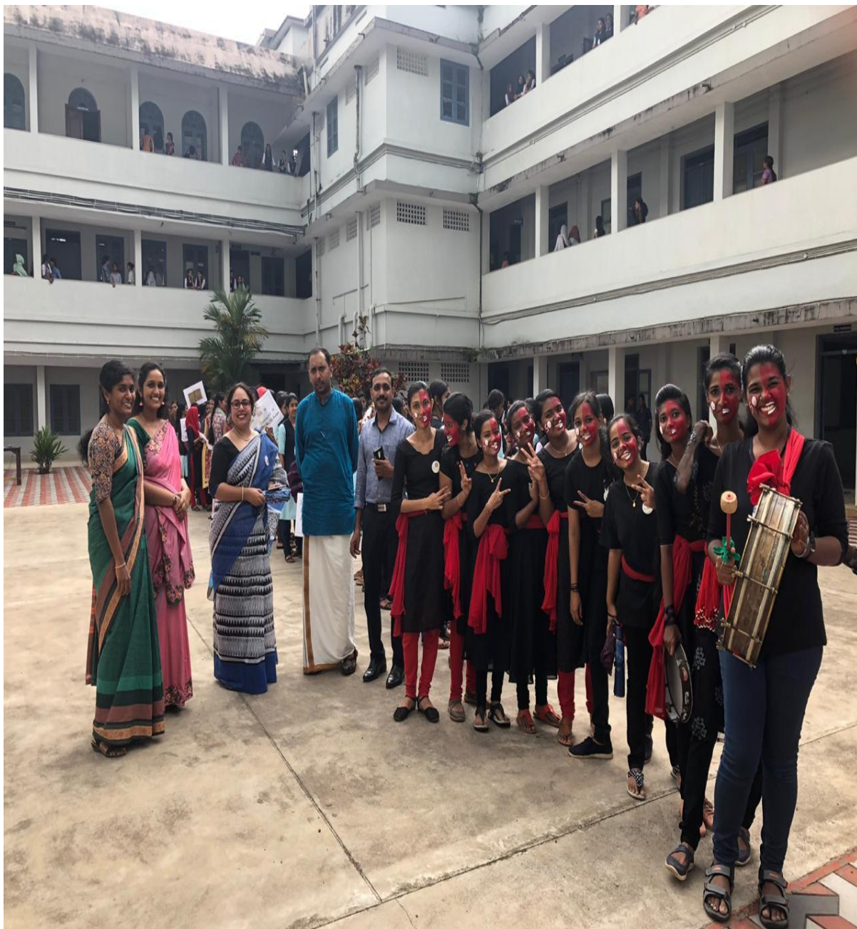
NSS volunteers with program officers at Mar Thoma College for Women, Perumbavoor