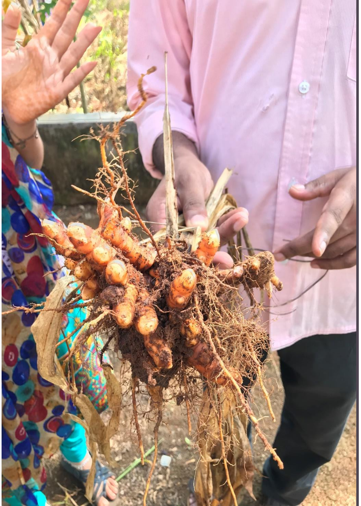
Kitchen Garden Project