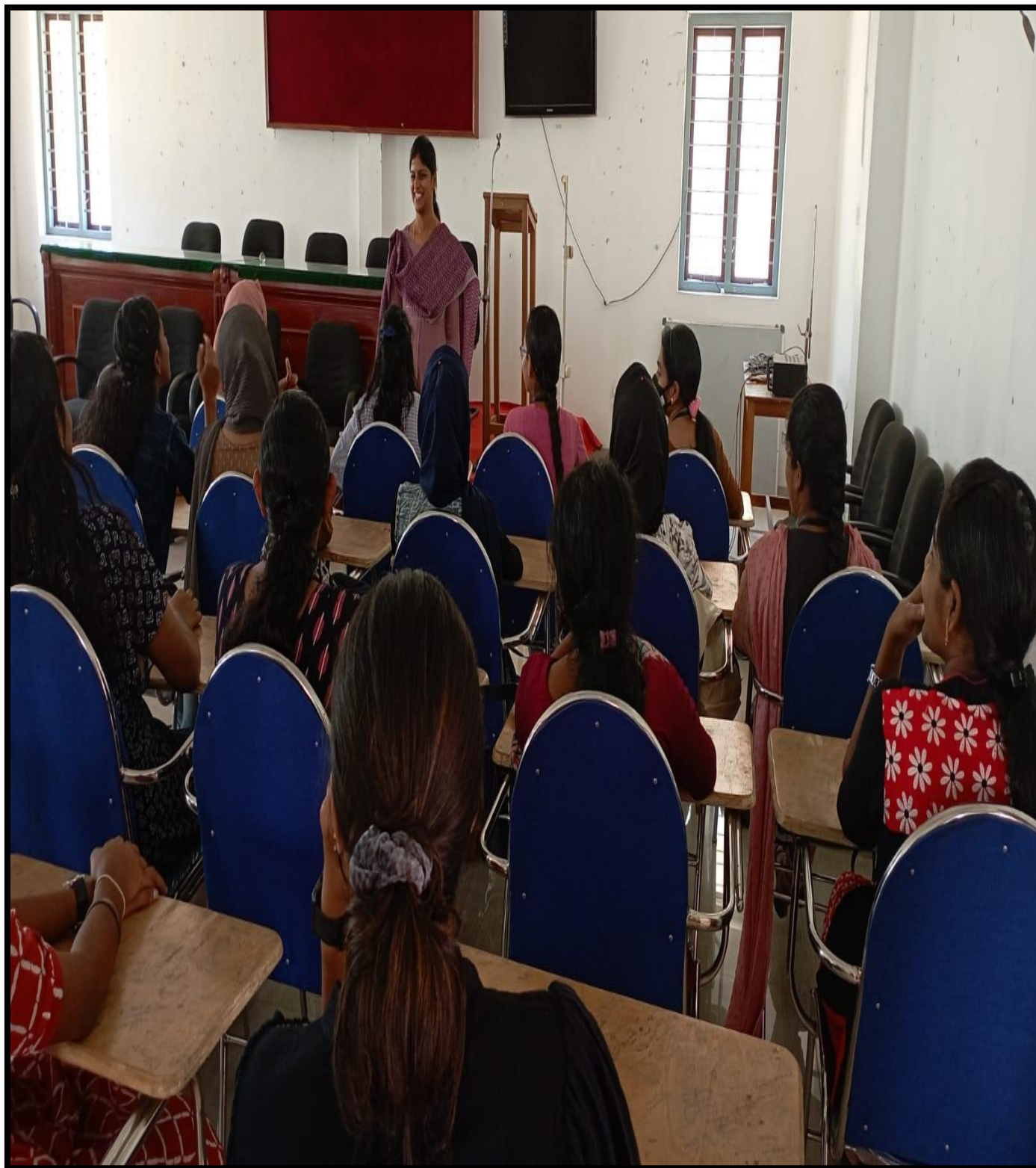
Trainer interacting with students