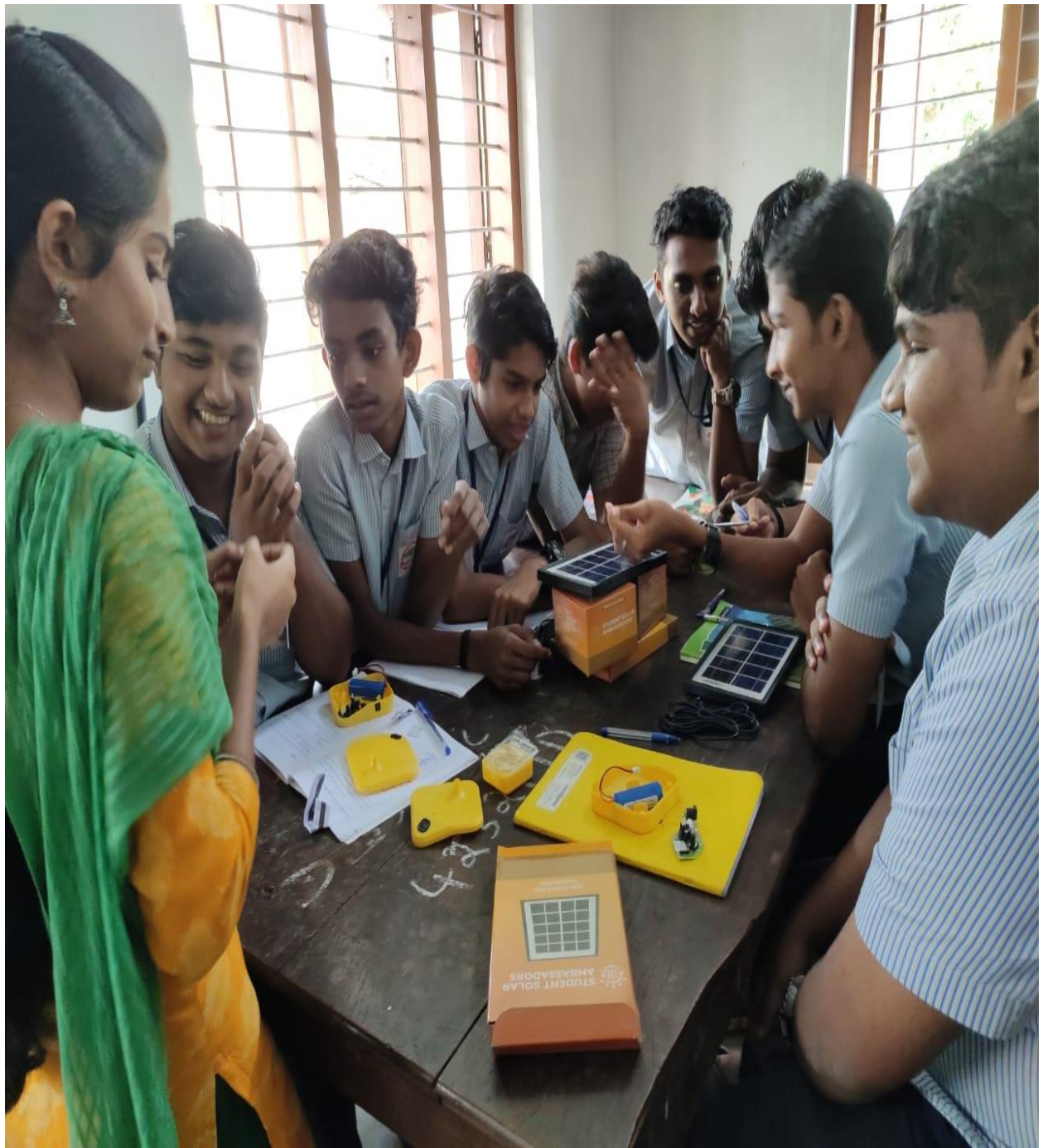
Student Ambassador Programme at Asram school on 30-10-2019