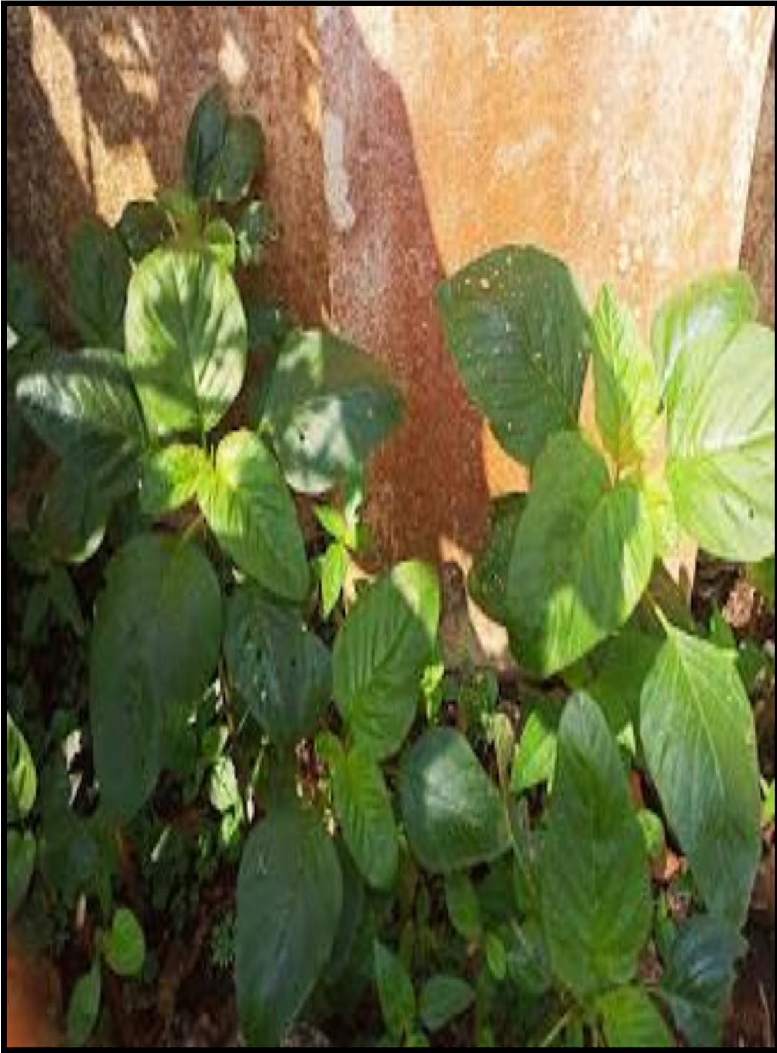
Kitchen Garden Made By The Students of Mar Thoma College For Women,Perumbavoor