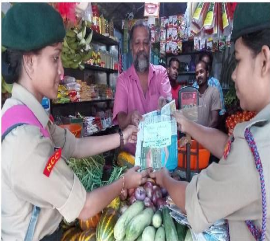
NCC Cadets Distributing the paper bags made by them in nearby shops as part of Social Responsibility