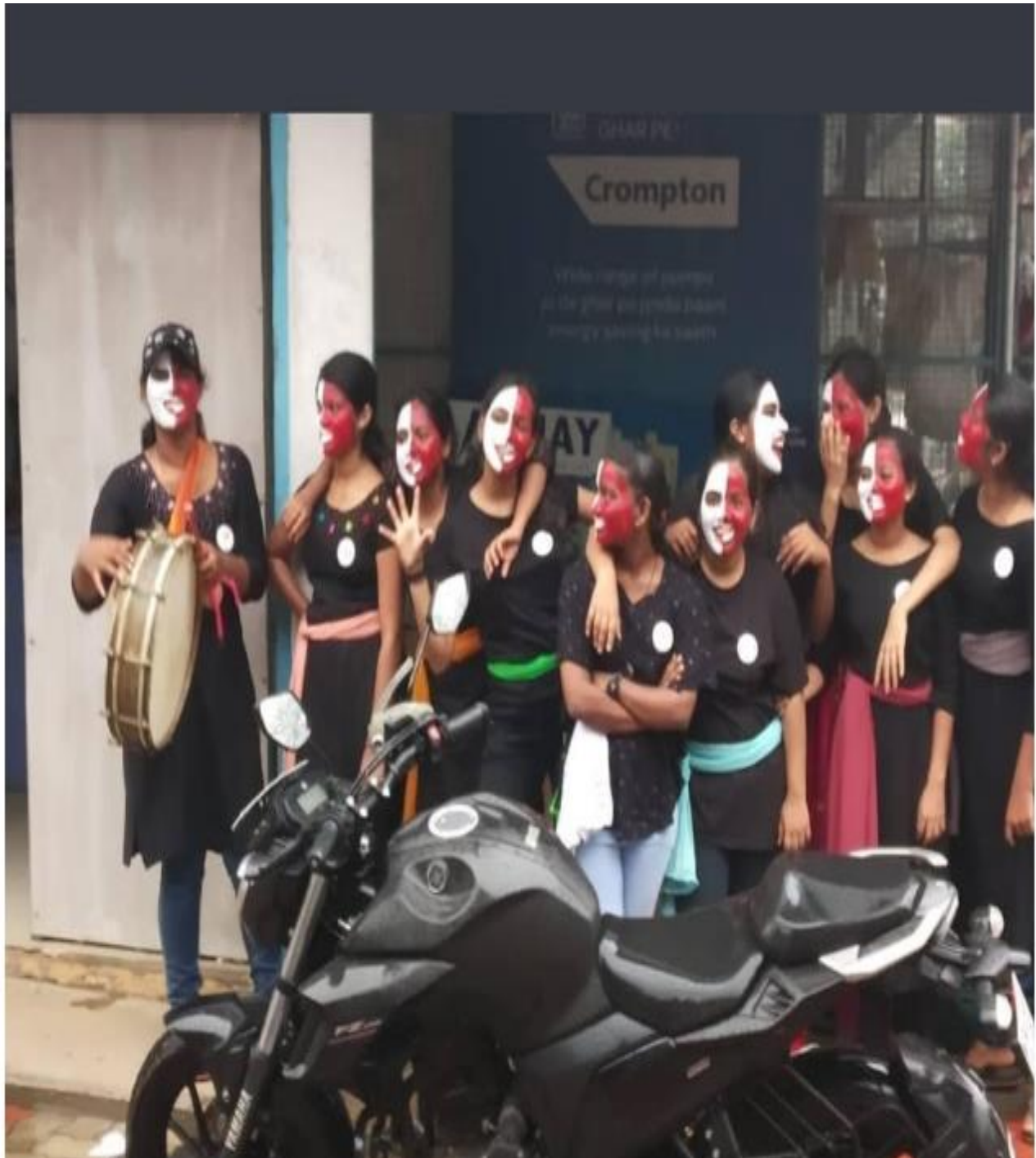
The NSS Unit of Mar Thoma College for Women, Perumbavoor, conducting a street play as part of the literacy campaign on 8/8/2019 at Perumbavoor.