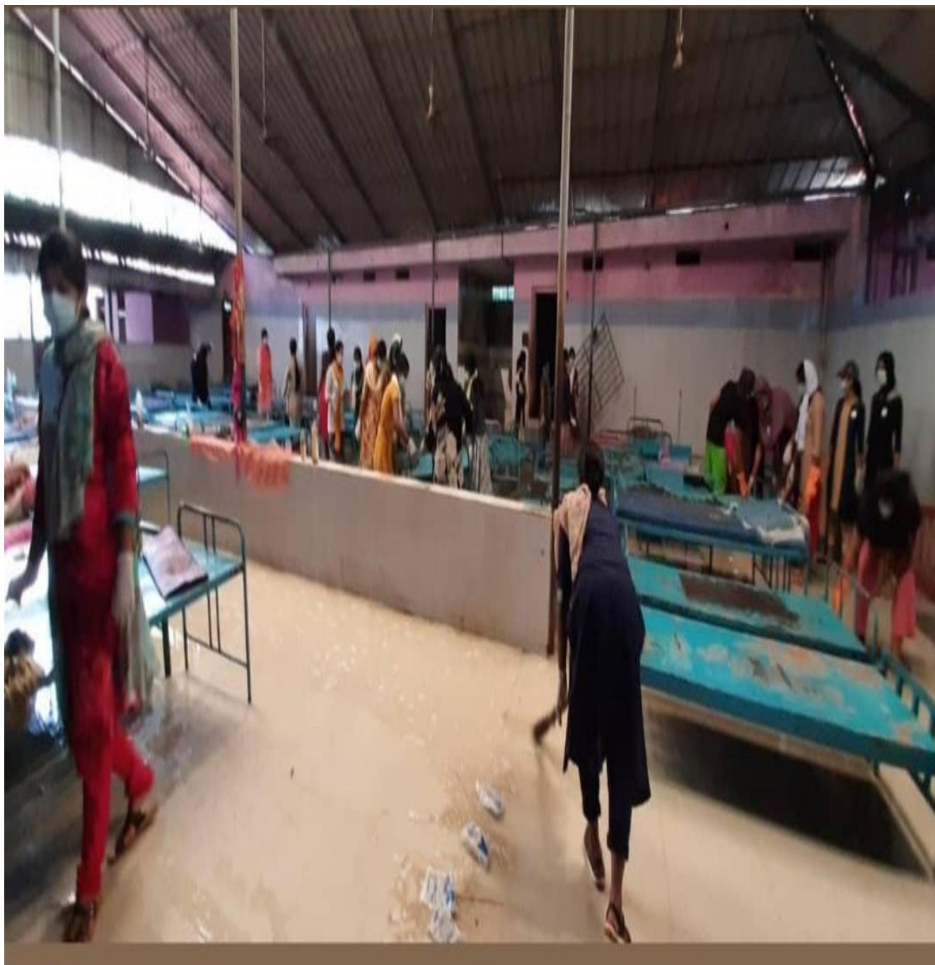
NSS volunteers cleaning “Bethlehem Abhaya Bhavan” on 6 September 2019