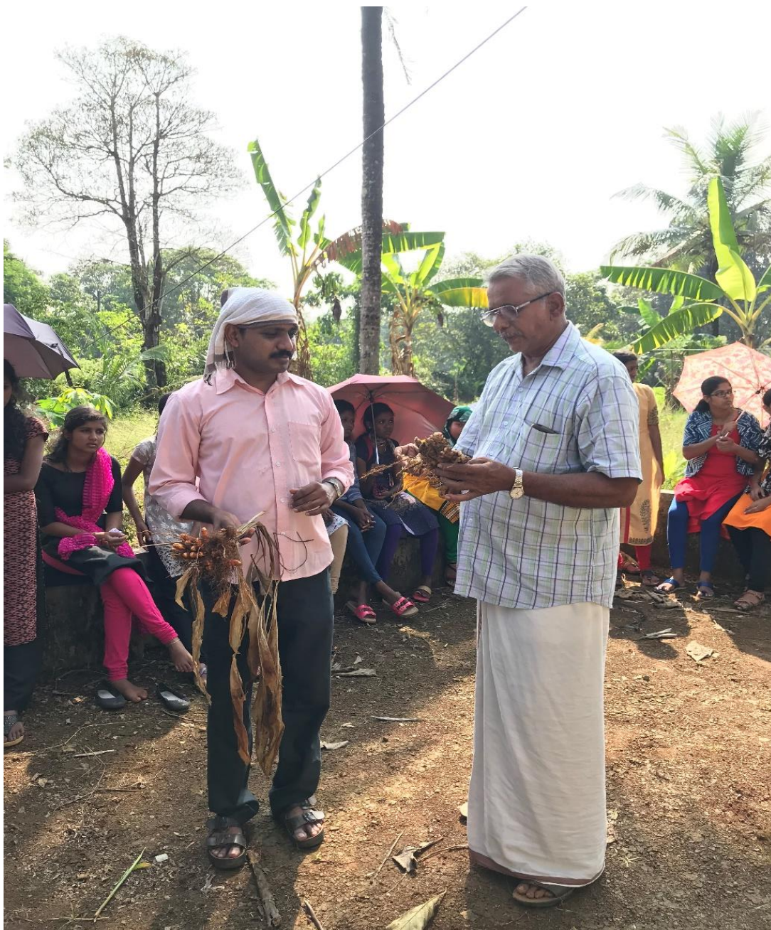
The NSS unit of Mar Thoma College for Women, Perumbavoor conducting a cleaning and organic farming awareness programme at Ganapathy Vilasam School, Thottuva on 7/9/2019