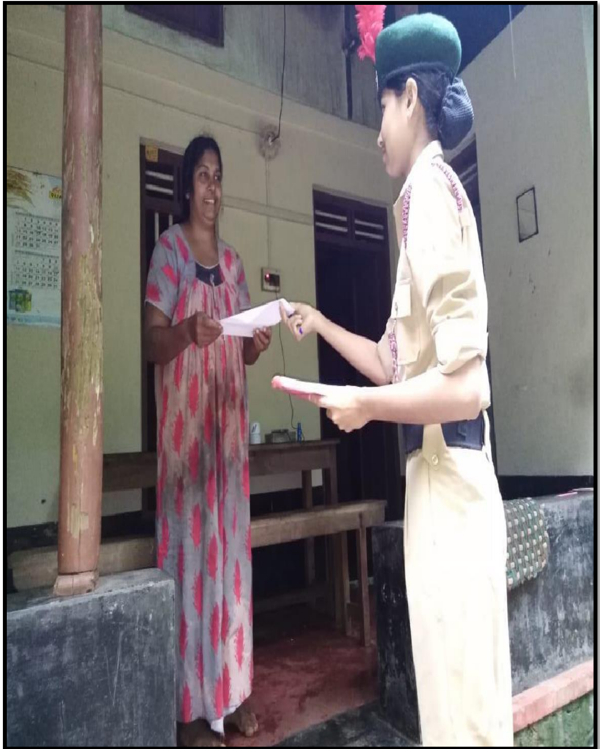
NCC Cadet giving water survey report to neighbours