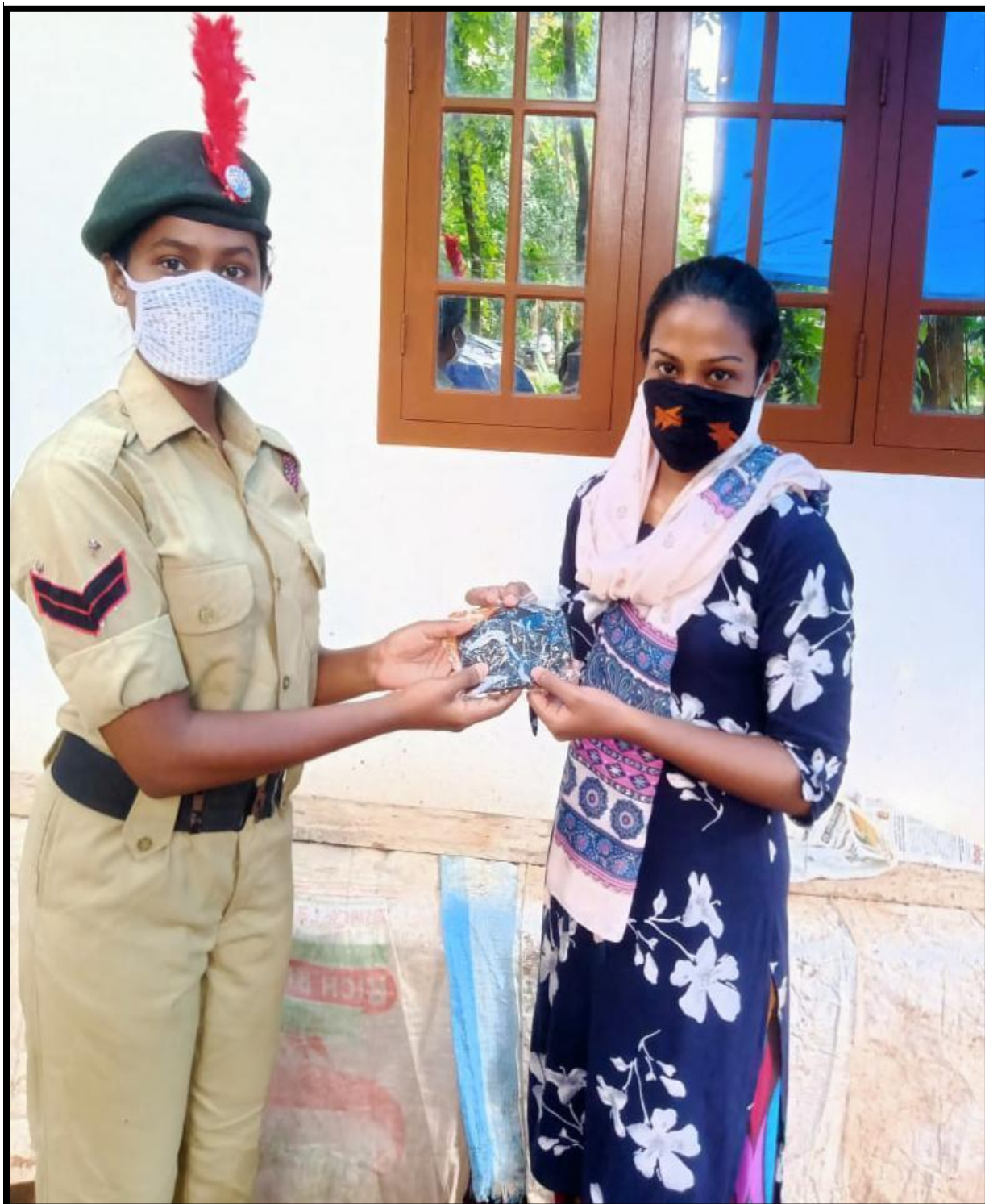
On January 15, 2020, the National Cadet Corps (NCC) unit of Mar Thoma College, Perumbavoor, conducted mask distribution drive in the Perumbavoor town area