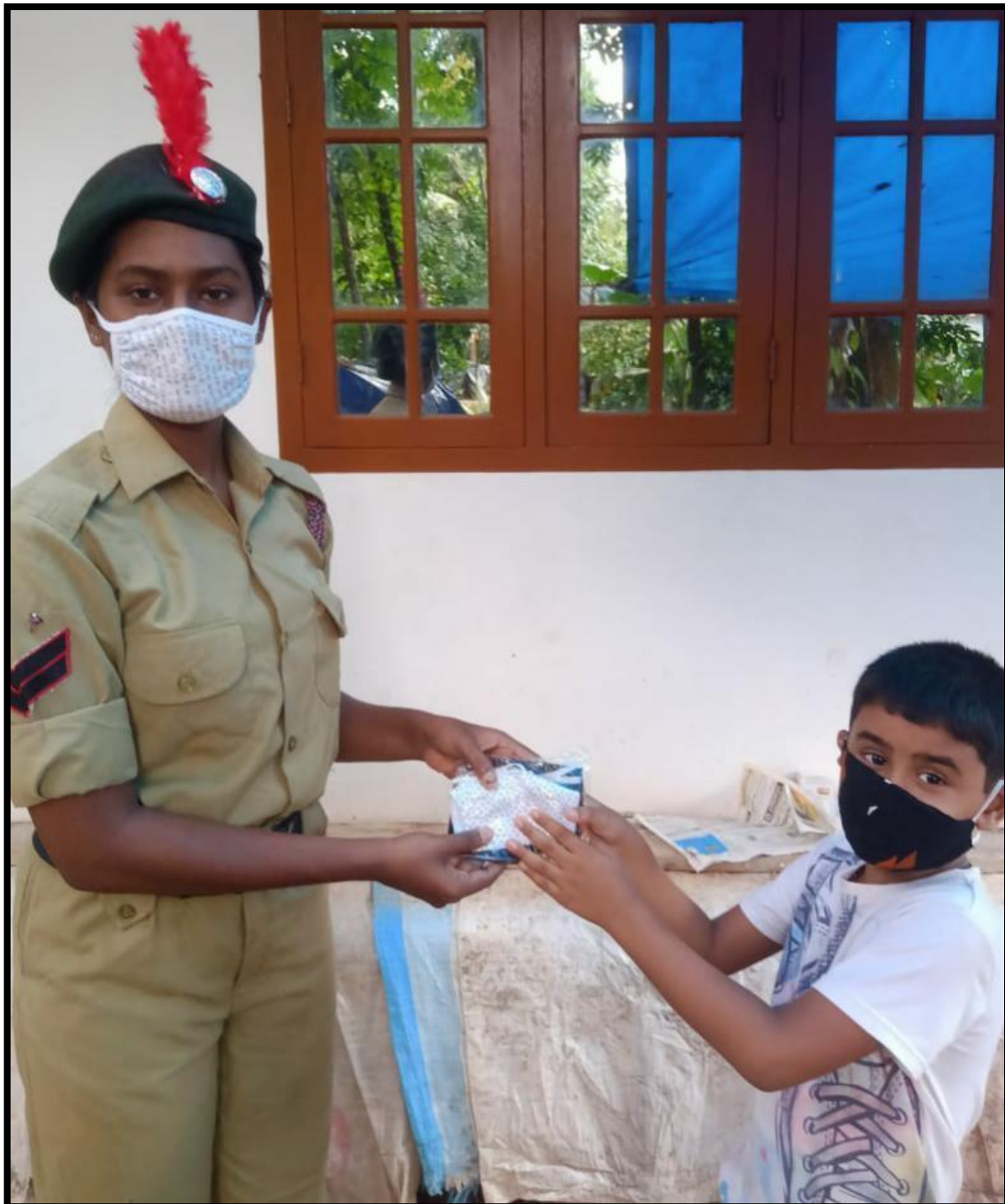
Mask distribution drive