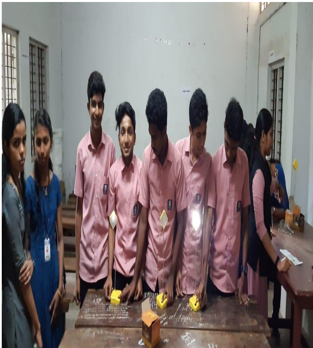
Student Solar Ambassador Programme at Govt Higher Secondary School,Perumbavoo on 29-10-2019