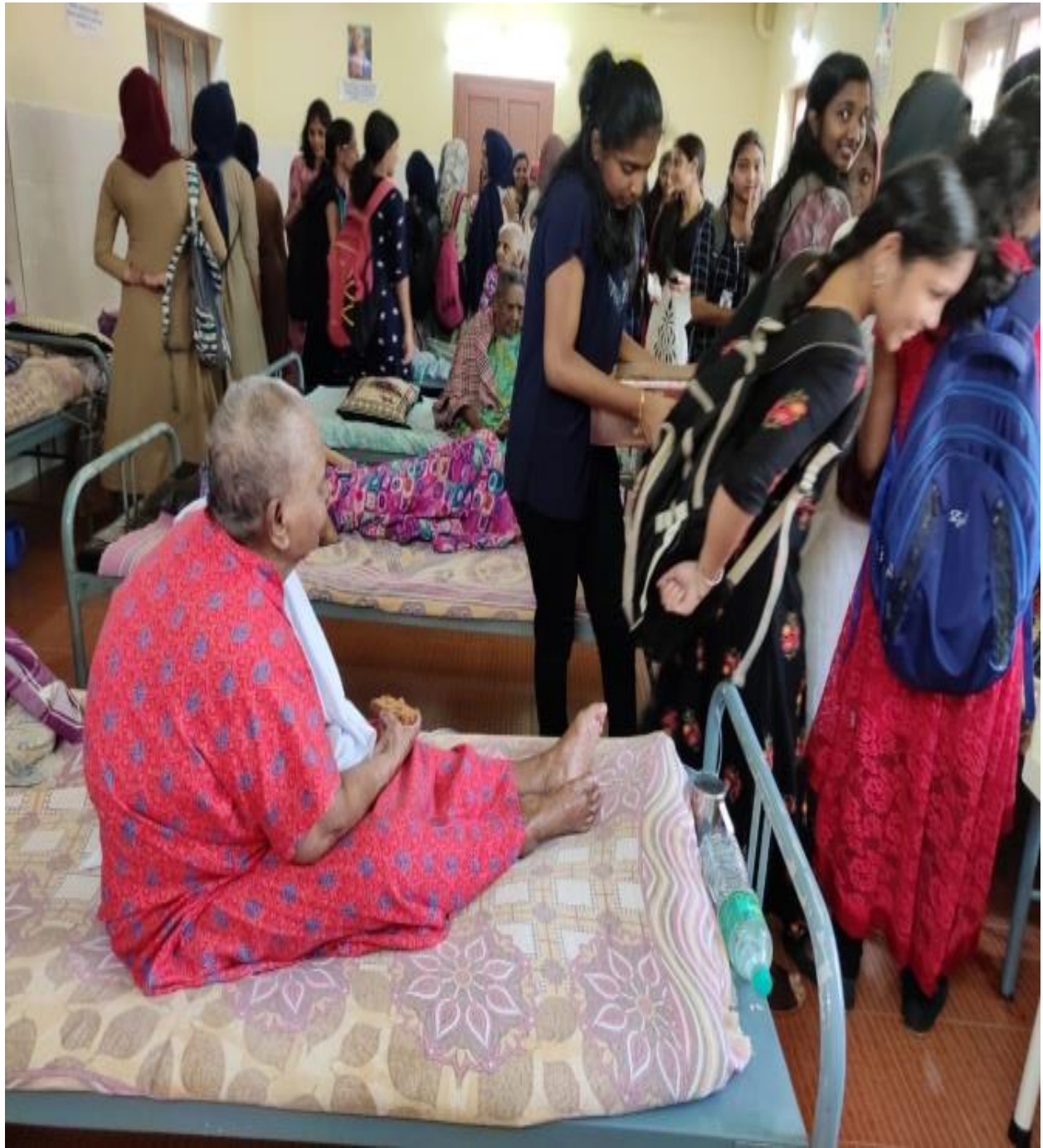
Students visiting Old age home-“DAIVADHAAN”