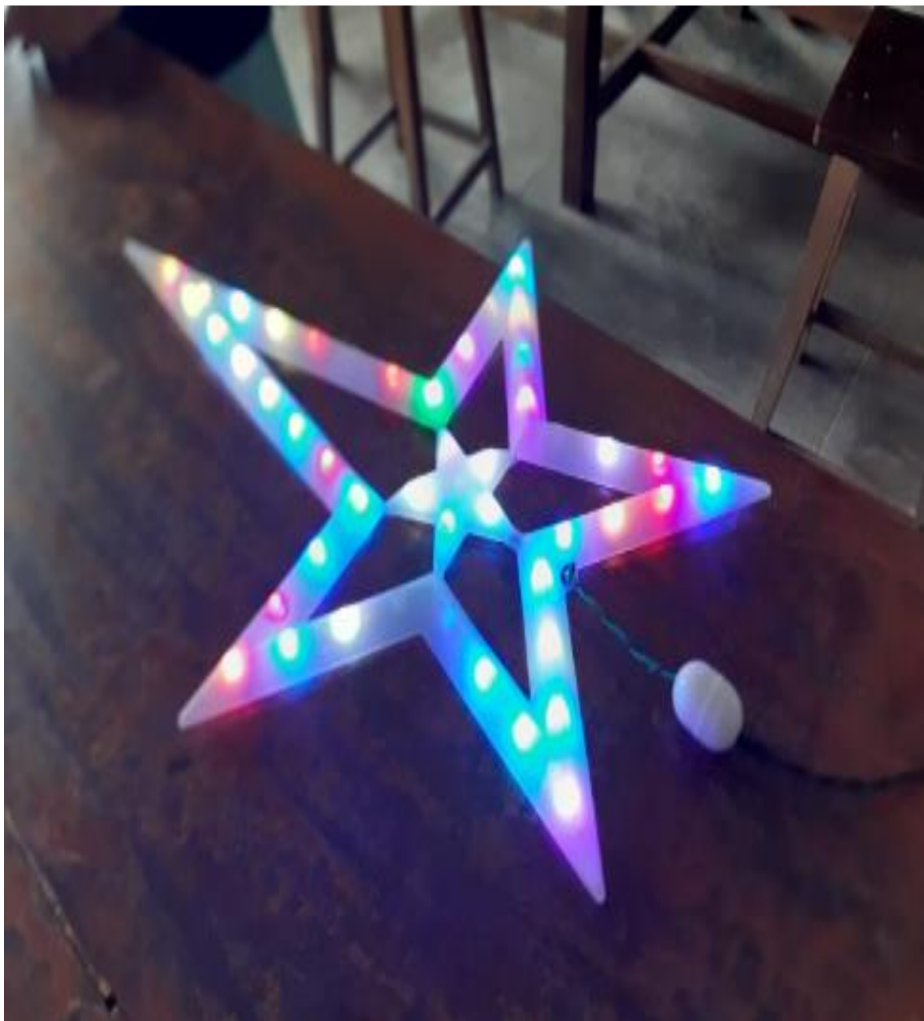
LED stars made by students of Mar Thoma College for Women, Perumbavoor 18-December-2019