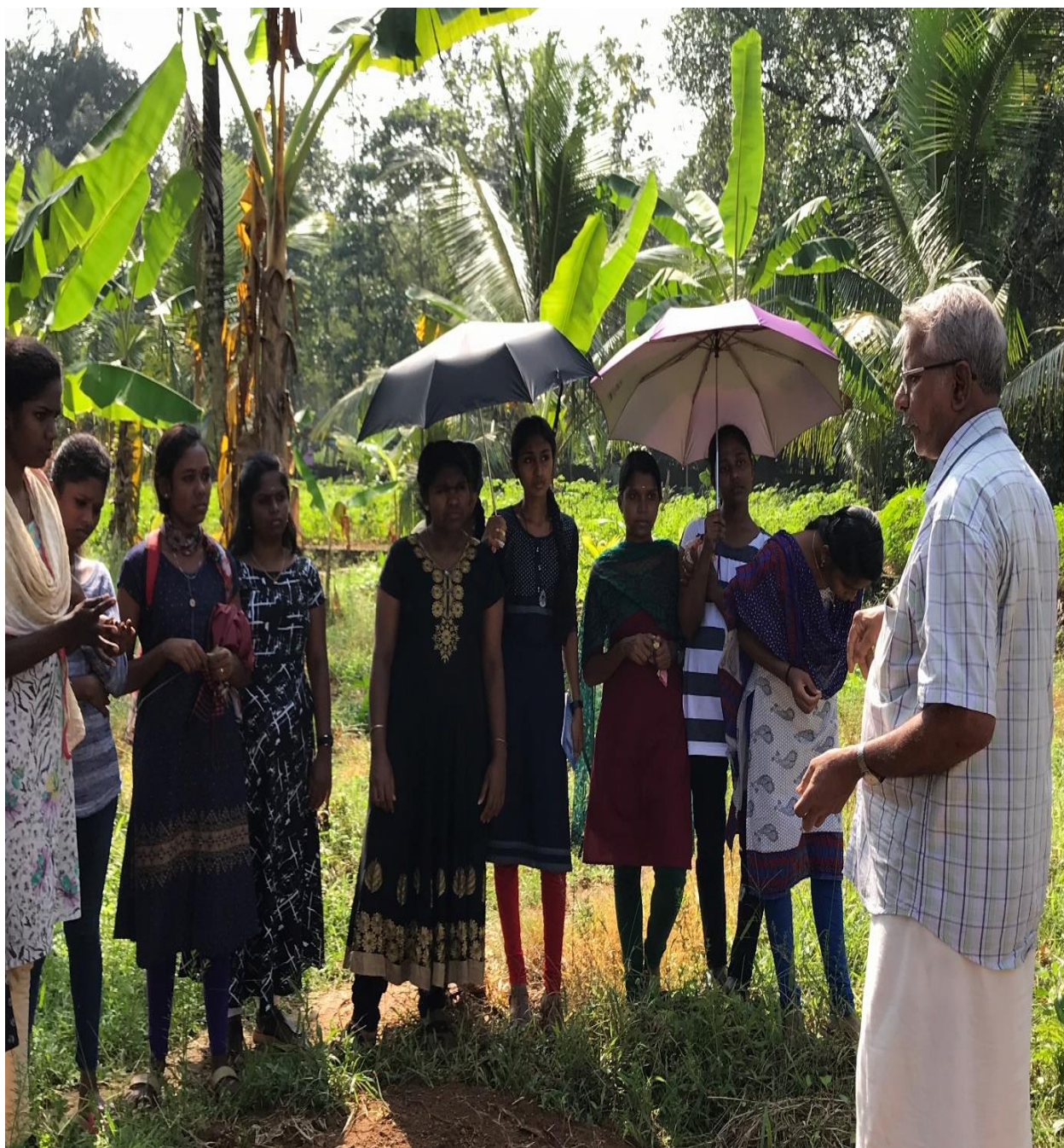
Students attending organic farming awareness class from nearby farmers