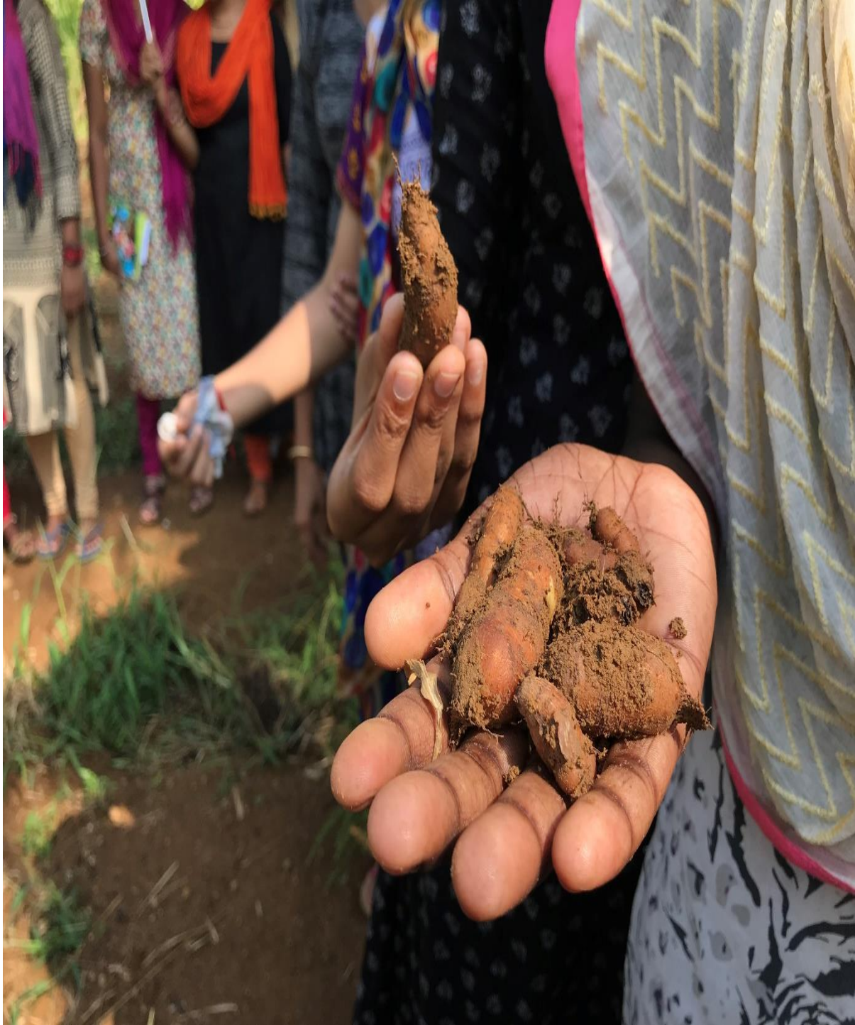
Kitchen garden made by students