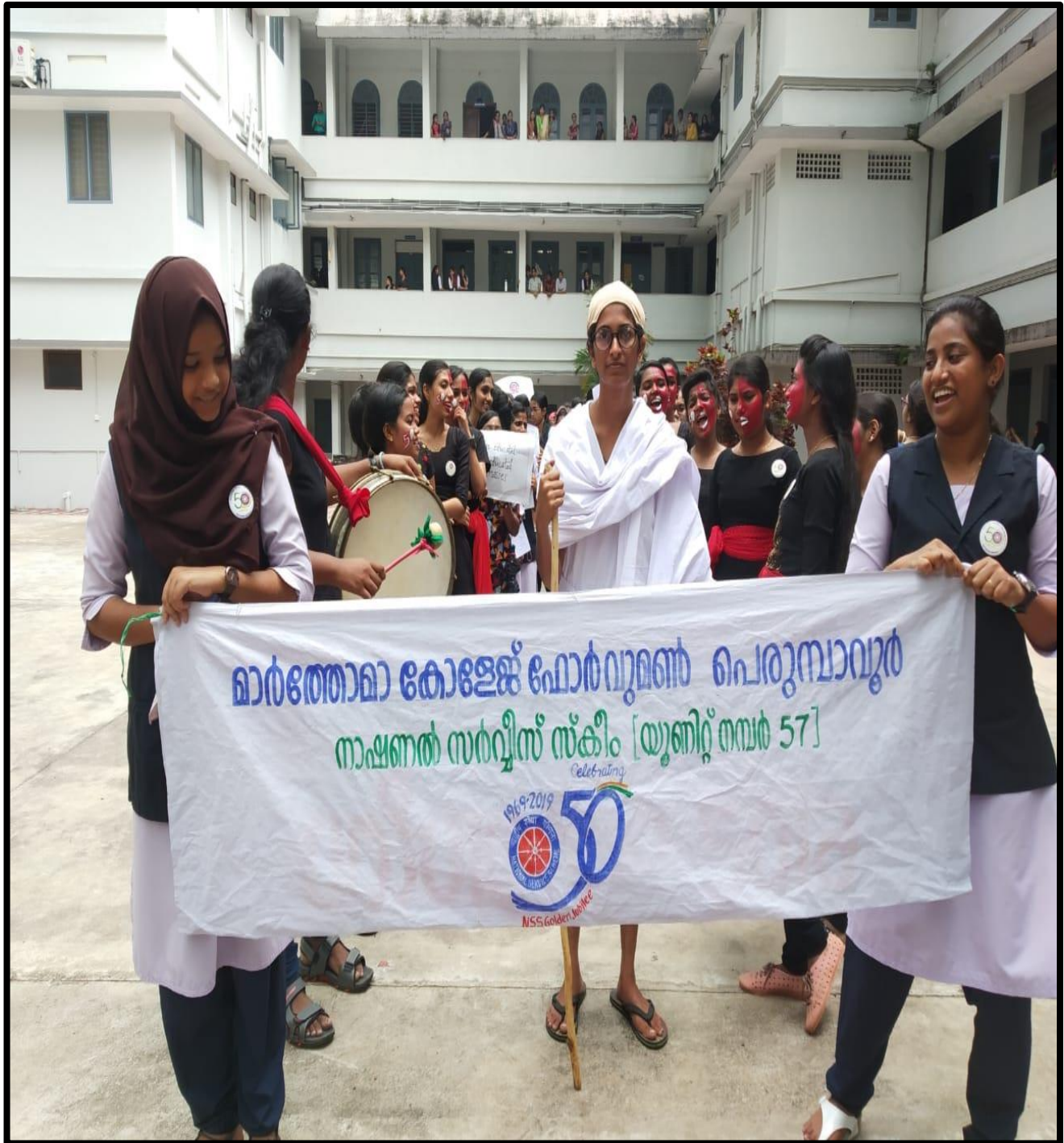
Padayatra organized by NSS unit of Mar Thoma College for Women,Perumbavoor on 8-8-2019