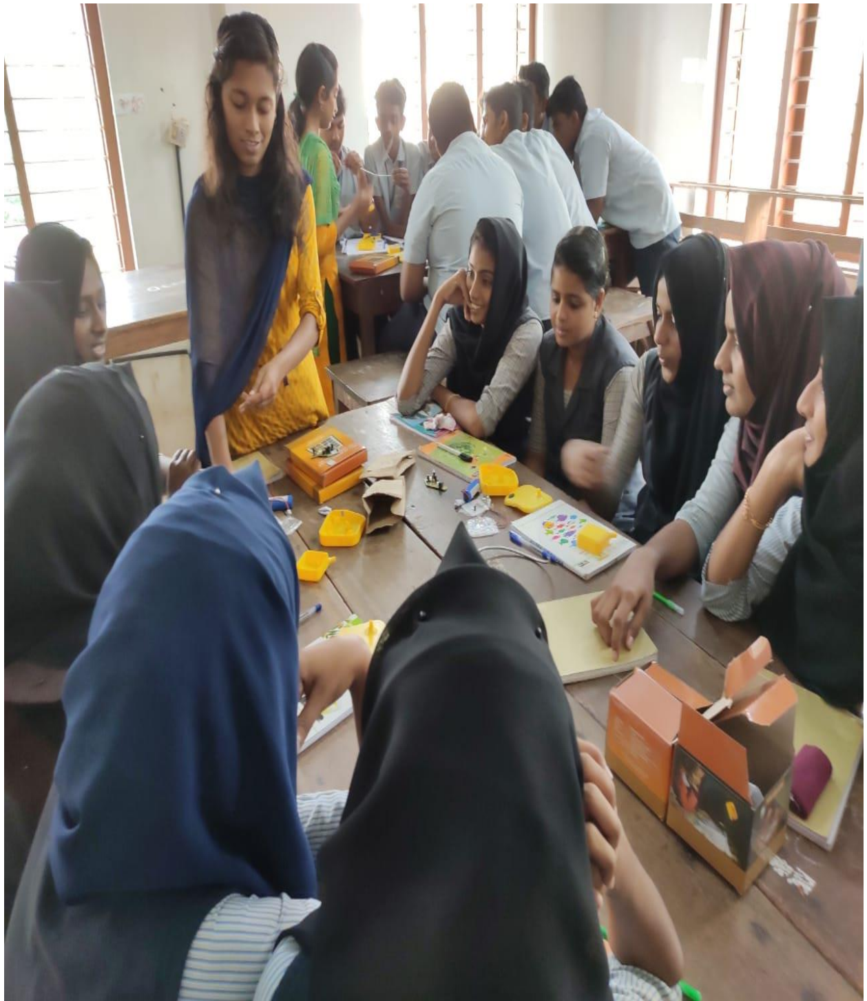
Student Ambassador Programme at Ashram school on 30-10-2019