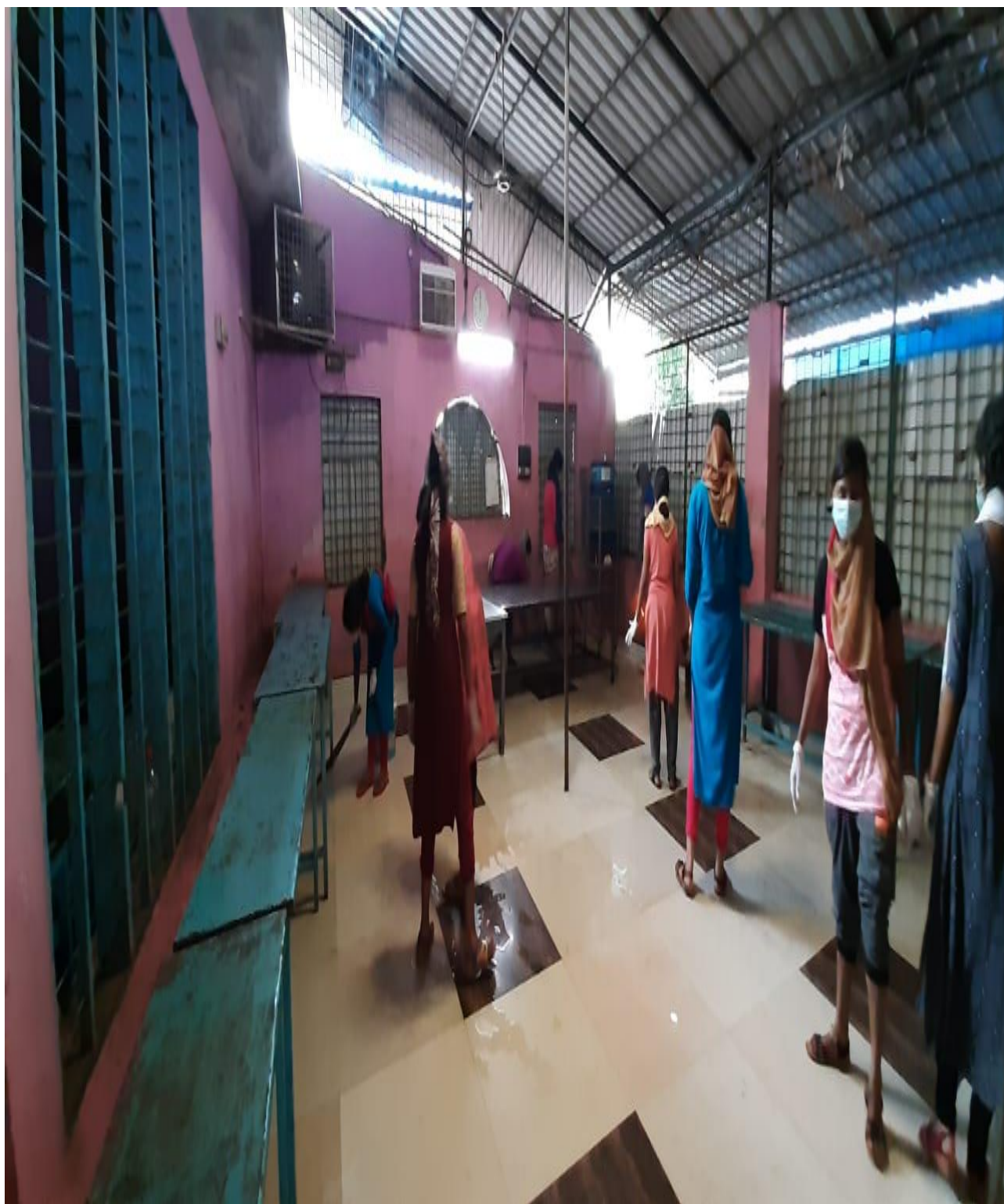
NSS volunteers cleaning “Bethlehem Abhaya Bhavan” on 6 September 2019