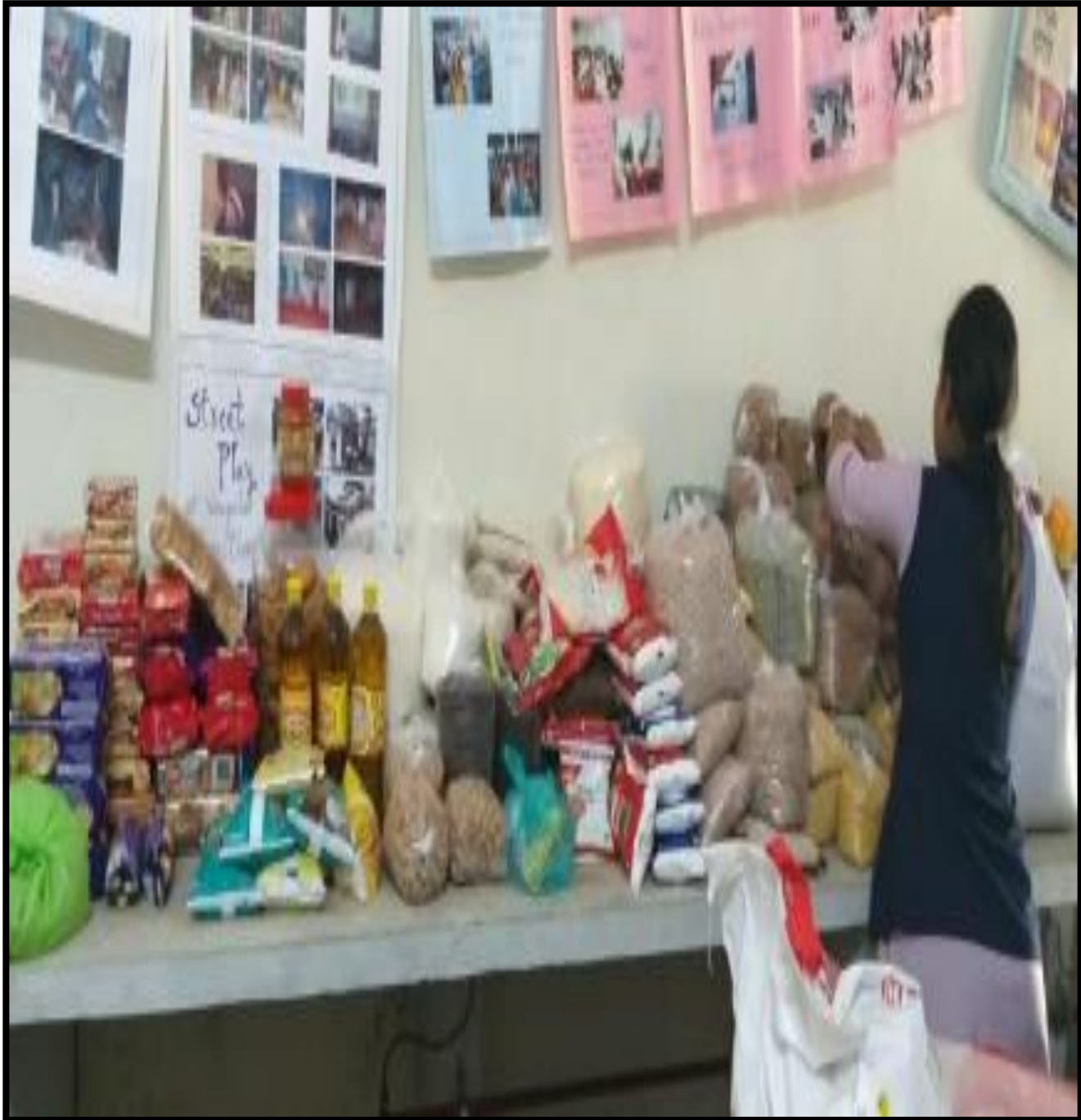
Students collecting necessary items for flood relief victims

The NSS unit of Mar Thoma College for Women in Perumbavoor collecting necessary items for flood victims in nearby locality in August 2019.