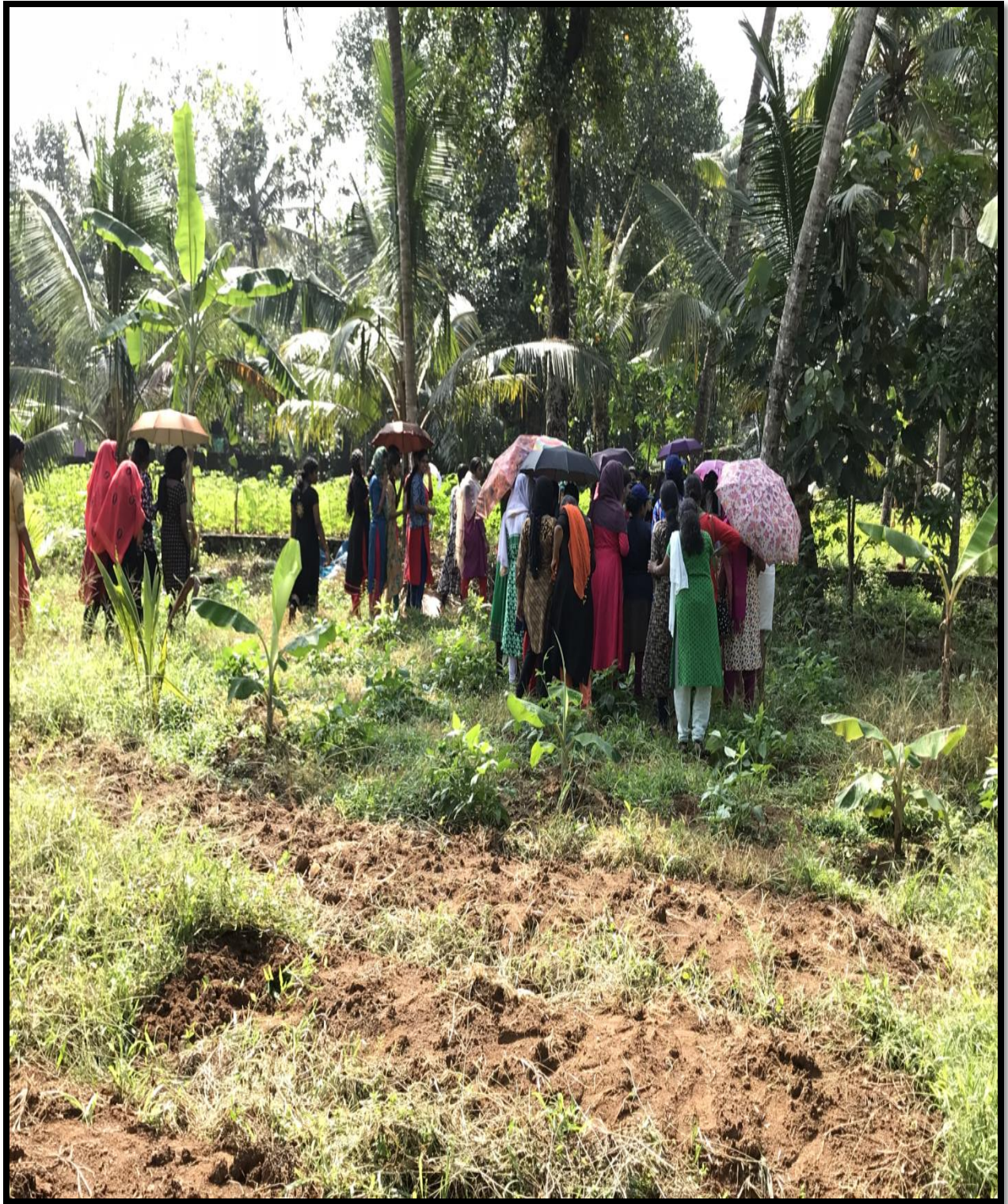
Students attending organic farming awareness class from nearby farmers