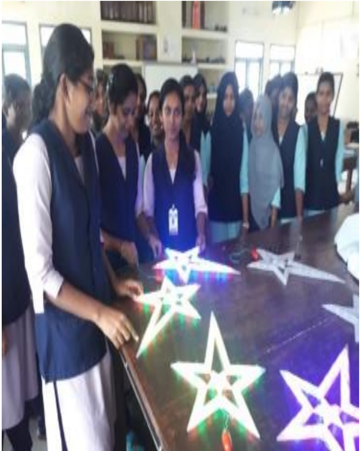
Students Explaining the benefits of LED lights to Junior peers